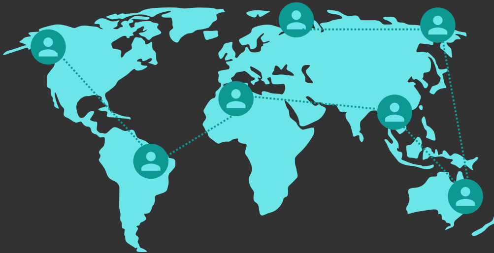
Churches Equipped in 2022

This year we were able to grow our coaching throughout the United States as well as in the Dominican Republic. We have plans to host several cohorts in the new year, deepen our relationships in the D.R., as well as begin coaching with several local churches in Maryland.